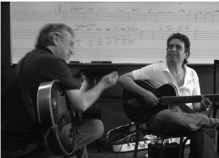
Two guys play guitar